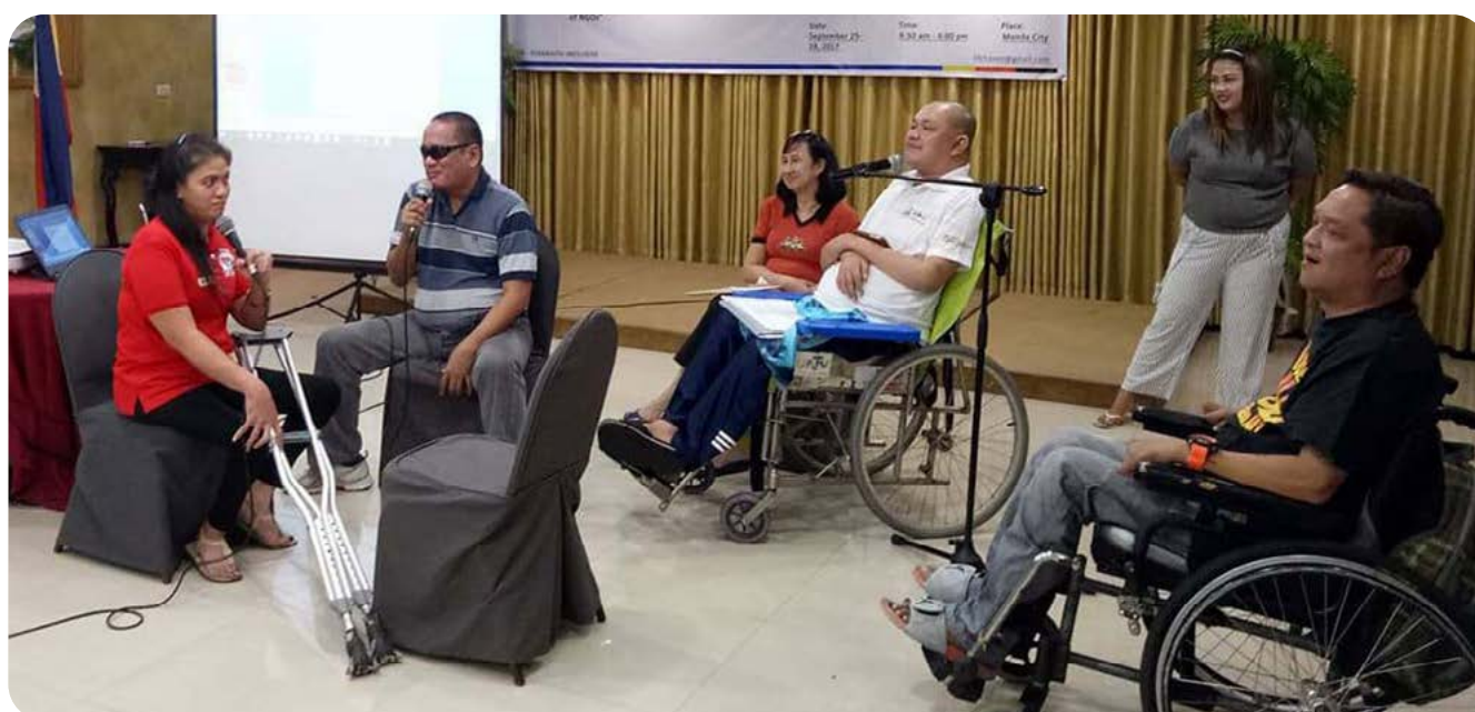
Above: A group of persons with disabilities lead a workshop in the Philippines.

“With their support we were able to get a separate article in the Disability Rights Act that focused on women and children with disability. They helped us to develop advocacy tools and to think about how to influence the political scenario.”