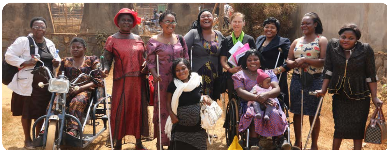
Above: Women with disability in north west Cameroon have become organised and active.

Hearing and adapting to this feedback is an essential part of the way CBM Global can shape and develop its work in a way that is based on the views of persons with disabilities. The listening exercise celebrates what is working well and identifies areas for improvement. It is offered as an example of what partnership can mean and as a contribution to the wider efforts of integrating organisations of persons with disabilities into international cooperation.